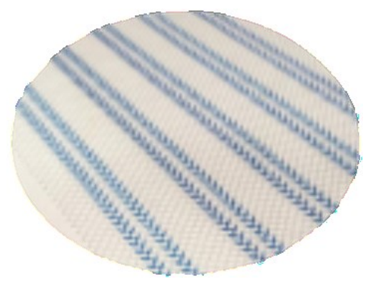
Figure 1. An example of a polypropylene mesh.

The current mesh implants (Fig. 1) are composed of polypropylene (PP), polyethylene terephthalate (PET), expanded polytetrafluoroethylene (ePTFE) and polyvinylidenefluoride (PVDF).<sup>1</sup> Mesh implants have been widely used, but given the number of complications associated with mesh insertion, and the recent media coverage relating to the lawsuit against the National Health Service (NHS) in UK for the current use of polypropylene mesh inserts (<u>http://bbc.in/2oHu7zT</u>), pursuing research for the development of a new generation of mesh inserts is now of the utmost